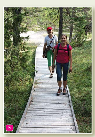
The Kolkasrags Pines trail