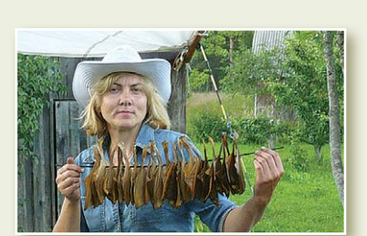
Open farm "Krāces" in Kolka